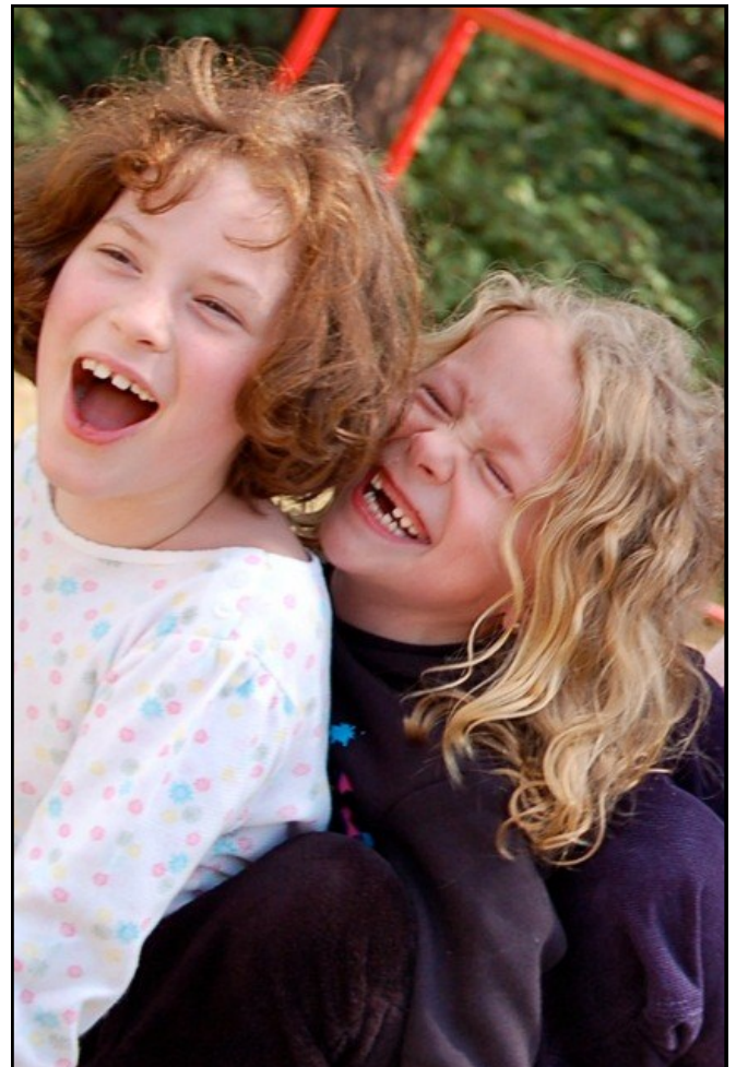
ANOTHER FUN WEEK AT CARVER SCHOOL